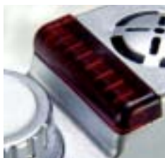
Brightest alarm light enhances visibility