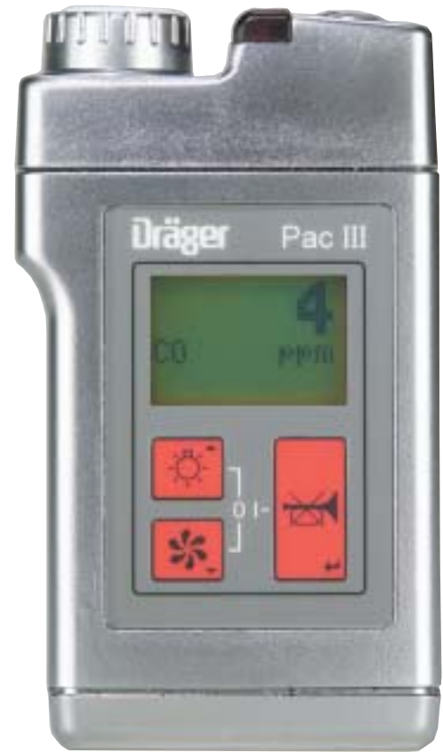
Toughest, Loudest, Brightest, Smartest, Single Gas Instrument