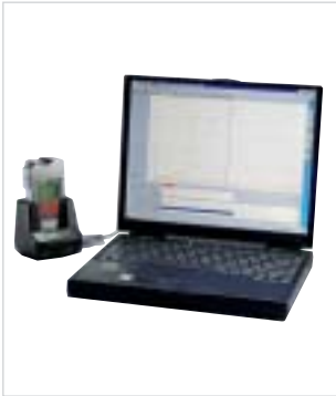
Computer Download Kit