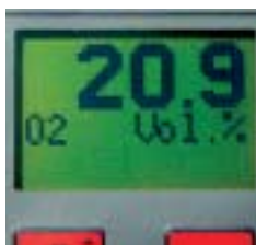
Largest backlight graphics display

SINCE 1937, WHEN WE INTRODUCED OUR FIRST DETECTOR TUBE, DRAEGER HAS BEEN THE WORLD LEADER IN THE DETECTION OF GASES AND VAPORS IN THE INDUSTRIAL WORKPLACE. OVER THE YEARS WE HAVE DEVELOPED MORE SENSORS AND DETECTION DEVICES FOR MORE APPLICATIONS THAN ANYONE ELSE! OUR LEADING EDGE TECHNOLOGY HAS KEPT US ON THE FOREFRONT OF ADVANCEMENTS IN ELECTROCHEMICAL SENSORS THUS PROVIDING THE MOST ACCURATE AND SPECIFIC RESULTS AVAILABLE.