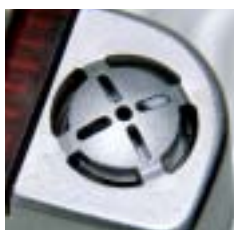
Loudest horn 95 dBA @ 1 ft. distance