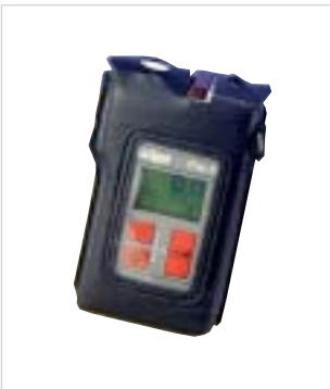
Leather Carrying Case